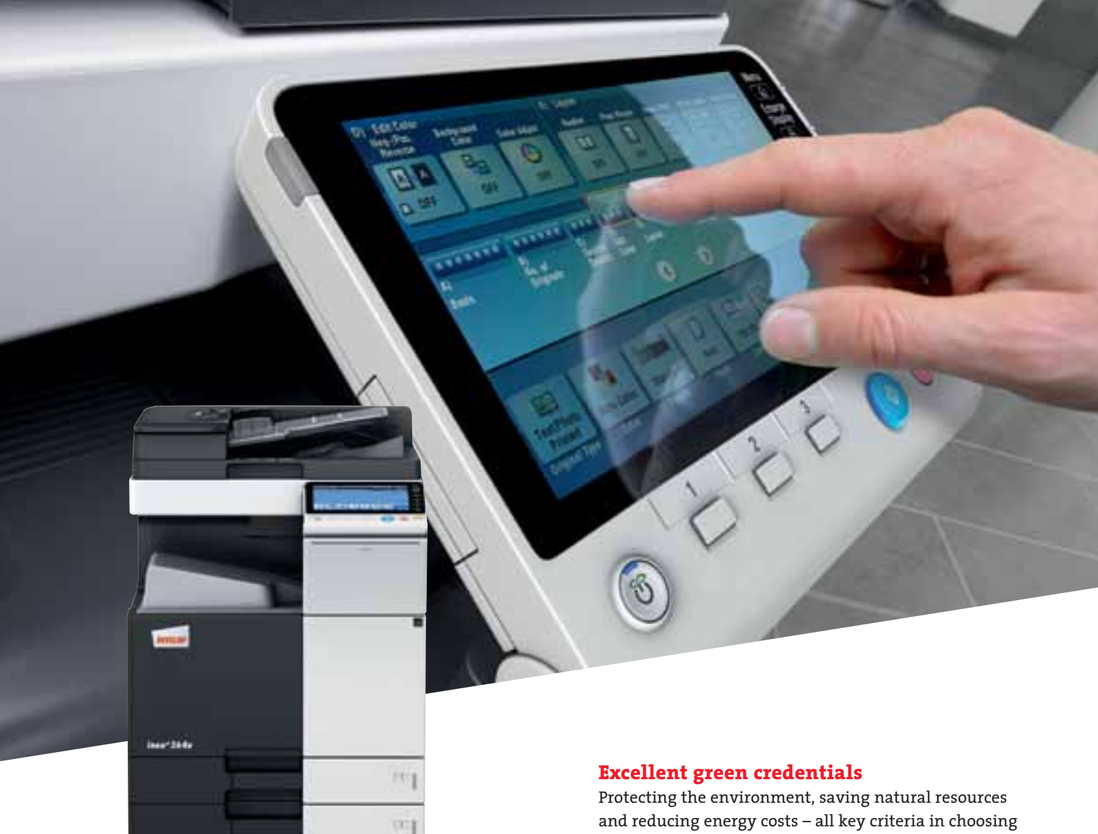
ineo+ 364e with paper feeder (PC-210) and dual scan document feeder (DF-701)

Protecting the environment, saving natural resources and reducing energy costs – all key criteria in choosing the right multifunctional system for your office. Here, the ineo+364e sets new standards in green energy efficiency.