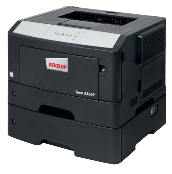
ineo 3300P with additional 550-sheet cassette (PF-P12)

If the operating system on your current printer is frustratingly difficult to follow and the device is difficult to use, it's time you considered switching to an ineo 3300P. Its ease of use will save your and your staff's time and effort in everyday printing jobs. And nobody will have to consult an operating manual before using this new printer.