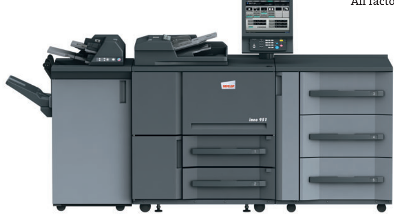
ineo 951 with 100 sheet finisher FS-532, post inserter PI-502 and the paper feed unit PF-706

If you think you've seen everything in digital printing, take a good look at the quality of this machine's printing. We believe it is unique. Such eye-catching quality is based on a series of innovative technologies, such as precision LED exposure with an impressive resolution of up to 1,200 dpi, sophisticated and ultra-stable media handling, and Develop's unique screening technology. These technical innovations work hand in hand with Develop's own ineo toner to deliver consistently excellent digital quality. And the advantage of digital technology is that you can produce even small print runs at a profit. This is especially true of the ineo 951 since it runs economically, scans at high speed, and is easy to operate via a clearly arranged touchscreen. All factors you can build on for business success.