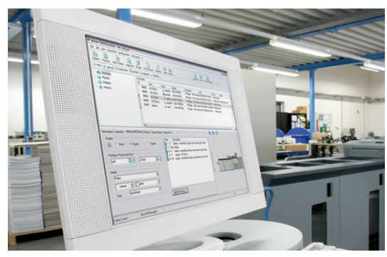
JT WEB 4 - the web-2-print Software Solution